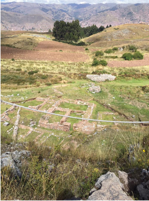
Inca Caves and Ruins

Even though I walk through the valley of the shadow of death, I fear no evil; for Thou art with me Thy rod; Thy staff, and me they comfort me.