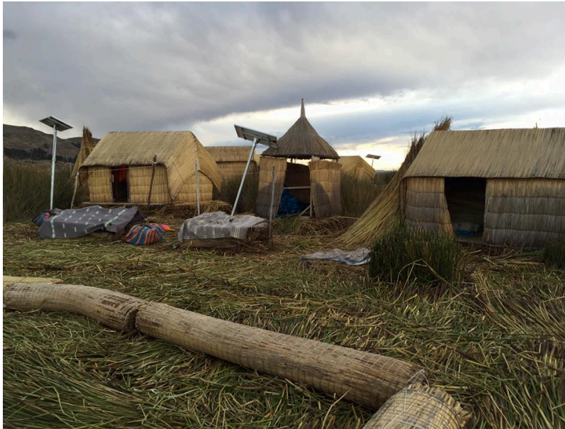
Floating Islands of Lake Titicaca

For if you forgive men for their sins against you, your heavenly Father will also forgive you. But if you do not forgive men, then your Father will not forgive your sins