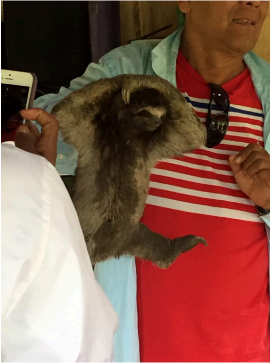
A sloth that we found hanging at a home in the Amazon