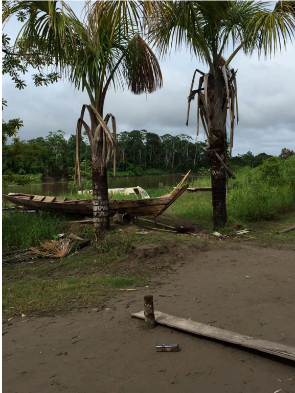
Village and School in the Amazon Jungle

Oh give thanks to the Lord, for He is good; For his lovingkindness is everlasting