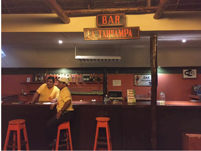
Explorama Lodge, Amazon Jungle

I urge you therefore, brethren by the mercies of God, to present your bodies a living and holy sacrifice, acceptable to God, which is your spiritual service of worship. And do not be conformed to this world, but be transformed by the renewing of your mind that you may prove what the will of God is, that which is good and acceptable and perfect.